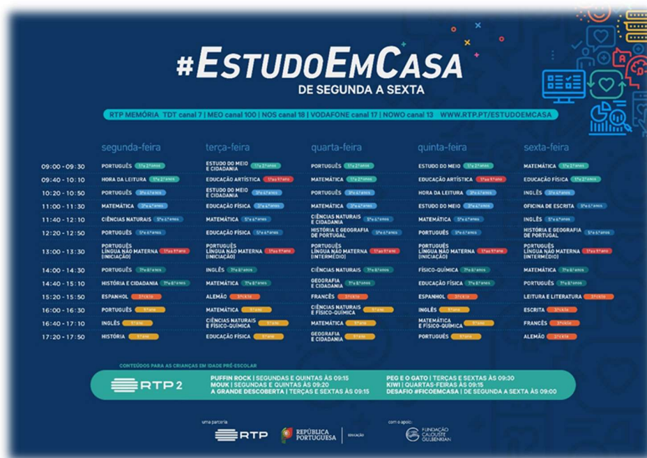
Figure 1. The #EstudoEmCasa - #StudyAtHome - weekly timetable grid ( https://apoioescolas.dge.mec.pt/node/762 )

Another obstacle is the fact that a number of families in Portugal don't have (yet) at home computers, or other digital device, suitable for distance online classes. To face this setback, a different strategy was built, #EstudoEmCasa - #StudyAtHome -, this time in a collaboration between the ME and the RTP (Portuguese Public National TV Broadcasting), with the support of the Calouste Gulbenkian Foundation (a private foundation with an important role in the Portuguese culture scene). The broadcasts started on April 20 th , 2020, from Monday to Friday, starting at 09:00 a.m. and ending at 05:50 p.m., according to the timetable on Figure 1 (below); the set of educational contents made available covered all curricular subjects (even Gymnastics), from kindergarten to 9 th grade, and were both produced and presented by a large team of teachers. As of June 26 th , 2020, the last day of the 2019/2020 school academic year (delayed by 3 weeks according to the initial plan), the numbers - 100,000 viewers, 45 school curricular subjects, and 305 hours of broadcast - show the vast dimension of this entrepreneurial experiment, an enterprise that counted even with a special class from the President of the Portuguese Republic himself.