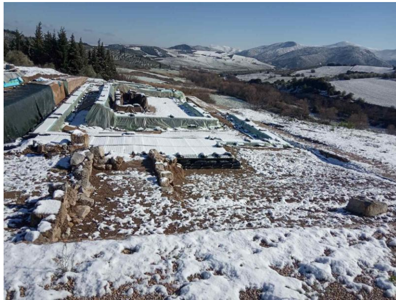
Fig. 4. Kalapodi. Fthiotis Greece (2021). The ruins of the site are protected during winter by seasonal covering with geotextile and insulation panels.

The phenomenon of frost poses a constant danger to the site's materials, which, in combination with the vulnerable structural materials, causes decay problems. Currently this is solved by seasonal covering with geotextile and insulation panels. Due to climate change, in the future all these problems will become intense. The site participates as a case study for the TRIQUETRA program that started on 01/01/2023 and will last for 3 years. As part of the program TRIQUETRA, an integrated methodological model to protect archaeological remains at Kalapodi from frost, is proposed.