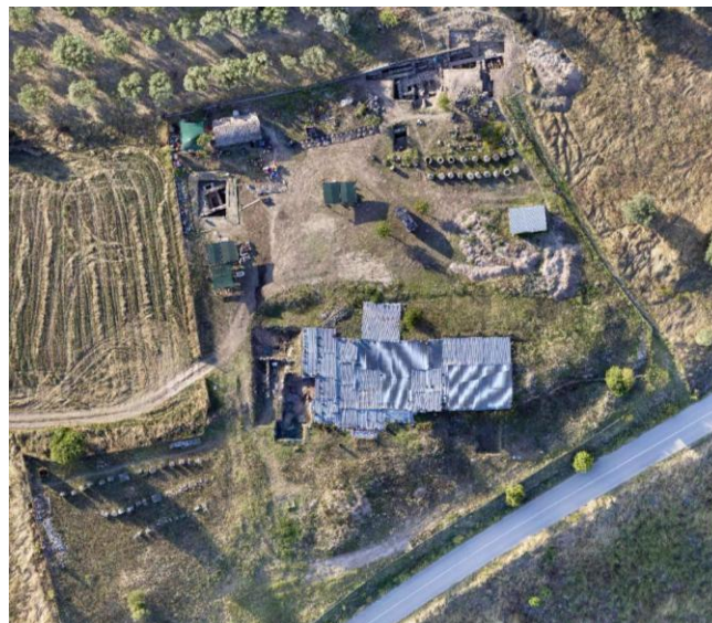
Fig. 2. Kalapodi. Fthiotis Greece (2017). The ruins of the site before presentation works.