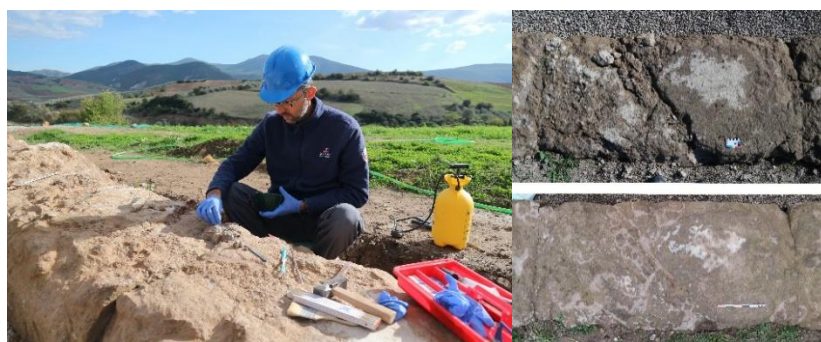
Fig. 8. Kalapodi. Fthiotis Greece. During conservation works (left), before and after conservation of a limestone from the archaic temple (right).