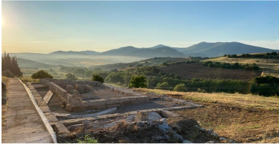
Fig. 6. Kalapodi. Fthiotis Greece.