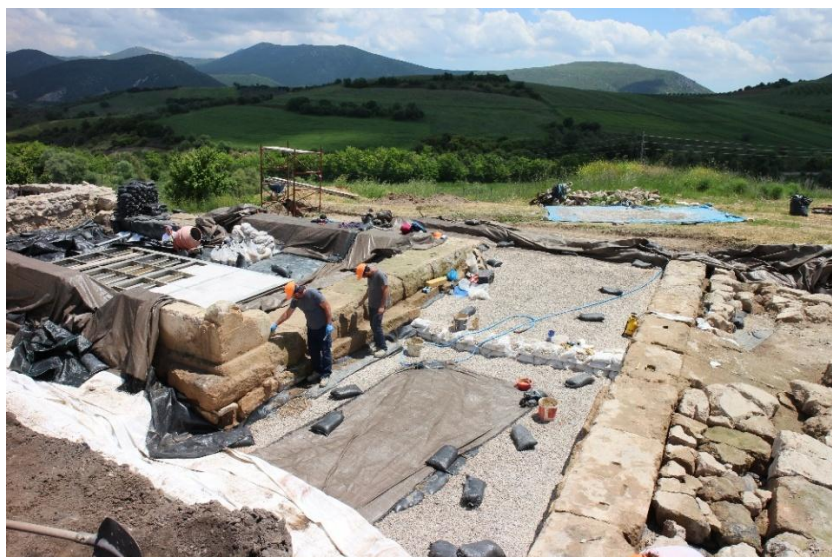
Fig. 7. Kalapodi. Fthiotis Greece. During conservation works.