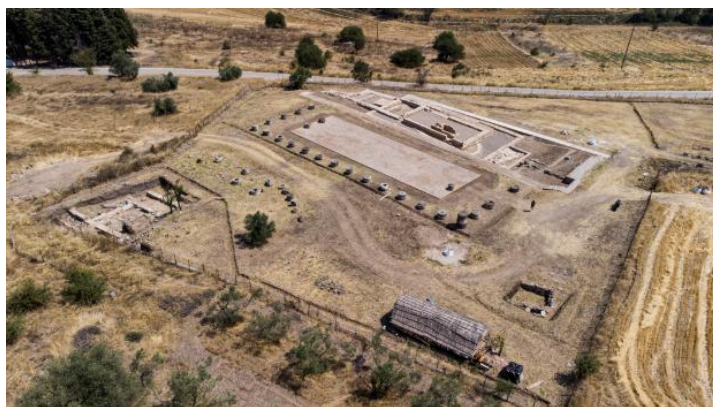
Fig. 1. Kalapodi. Fthiotis Greece (2023). The ruins of the site after presentation works.

In central Greece, in today's Fthiotis, where in antiquity Phokis bordered eastern Lokris and Boeotia, there is a sanctuary that is one of the most important of ancient Phokis [1]. The sanctuary was in the same region as the famous pan-Hellenic oracle of Apollo of Delphi. According to the excavators, the sanctuary, too, was possibly an oracle of Apollo, the famous one of Abae. Systematic excavations were carried out again in the sanctuary only in the second half of the 20th century, under the direction of the German Archaeological Institute; they continue to this day [2] (see The pilot sites are Kalapodi, Greece; Ventotene, Italy; Aegina Island, Greece; Choirokoitia, Cyprus; Epidaurus, Greece; Roseninsel, Germany; Argilliez, Switzerland; Smuszewo, Poland).