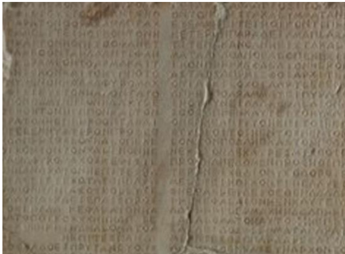
Fig. 1. Details of the inscription from the Propylaea Stele documented the financial accounts for constructing the Erechtheion (408-407 BC, Acropolis of Athens Museum).

The importance of epigraphs as historical and cultural objects and the need for their preservation and documentation has been recognized since the beginning of modern archaeology, and the technological breakthroughs of each era have been applied to their recording. This is evident from the application of the invention of photography as early as it was discovered in the 19 th century [3] to the modern use of artificial intelligence deep neural networks in textual restoration when necessary [4]. Despite their durable nature, as most epigraphic inscriptions have been lettered upon hard substances, such as stone, bronze, or ceramic, they are subjected to decay, spoilage, and attrition, with a significant risk of destruction and perdition. Epigraphs are laid to the environment and exposed to physical and anthropogenic hazards, such as season changes, fires, earthquakes, floods, wars, vandalism, or excessive tourism that threaten the monuments. An example of the importance of documentation and recording of an ancient artifact with inscriptions represents the case of the blocking outer doorway of Tutankhamun's tomb, full of stamps and ancient Egyptian official seals, which Howard Carter and Lord Carnarvon partially dismantled to access the tomb during their 1922 excavation (see Fig. 2).