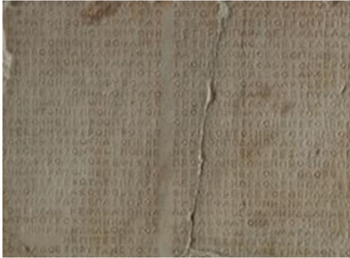
Fig. 1. Details of the inscription from the Propylaea Stele documented the financial accounts for constructing the Erechtheion (408-407 BC, Acropolis of Athens Museum).

The importance of epigraphs as historical and cultural objects and the need for their preservation and documentation has been recognized since the beginning of modern archaeology, and the technological breakthroughs of each era have been applied to their recording. This is evident from the application of the invention of photography as early as it was discovered in the 19 th century [3] to the modern use of artificial intelligence deep neural networks in textual restoration when necessary [4]. Despite their durable nature, as most epigraphic inscriptions have been lettered upon hard substances, such as stone, bronze, or ceramic, they are subjected to decay, spoilage, and attrition, with a significant risk of destruction and perdition. Epigraphs are laid to the environment and exposed to physical and anthropogenic hazards, such as season changes, fires, earthquakes, floods, wars, vandalism, or excessive tourism that threaten the monuments. An example of the importance of documentation and recording of an ancient artifact with inscriptions represents the case of the blocking outer doorway of Tutankhamun's tomb, full of stamps and ancient Egyptian official seals, which Howard Carter and Lord Carnarvon partially dismantled to access the tomb during their 1922 excavation (see Fig. 2).