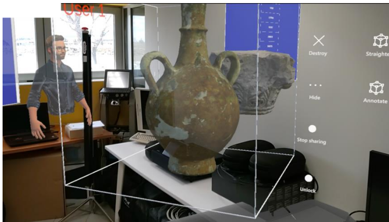
Figure 6. Screenshot of SustainLab during the co-creation of an exhibition: showcasing the placement and manipulation of 3D objects

contribution towards a next-generation networking tool. It operates on the same theoretical model and core digital services backend as the primary system, providing a collaborative environment equipped with remote interaction capabilities for designing cross-institution events and exhibitions and valuation functionalities, by using state-of-the-art augmented reality technologies, enhancing the collaborative experience. Figure 6-Figure 8 offer illustrative representations of how multiple individuals collaborate within the proposed augmented reality environment to co-create virtual exhibitions.