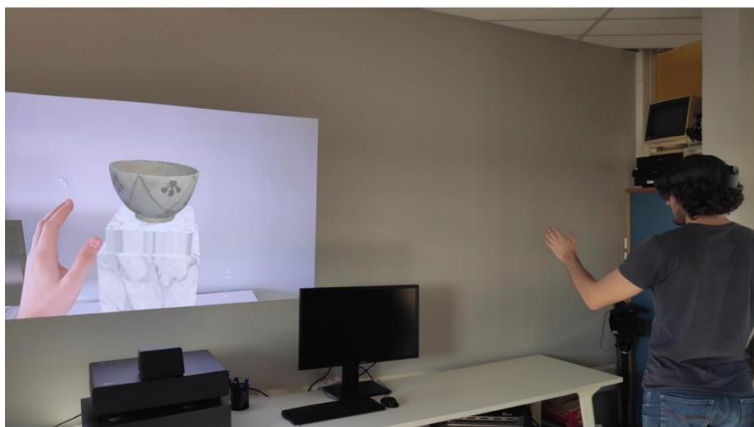
Figure 7. Photo of a SustainLab user during the placement and manipulation of 3D objects in the virtual exhibition space