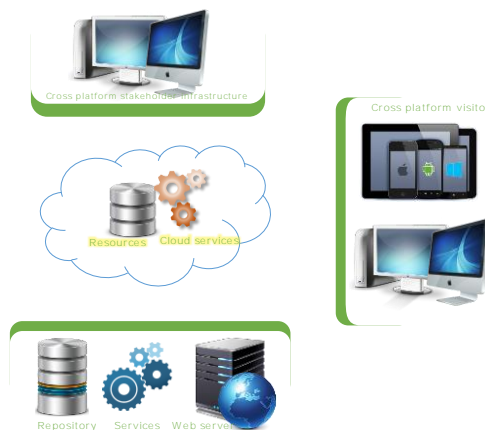
Figure 5. Architecture of technologies in project Thalia

It should be noted that all the technological solutions in project Thalia are based on a unified platform, encompassing a comprehensive content management system (CMS) backend tailored to the unique needs of cultural organizations. It not only delivers a unified view to visitors but also incorporates fundamental social networking and promotional functionalities. Beyond its presentation capabilities, this backend system stands as a central hub that effectively integrates all the applications and services within a shared management and presentation environment. It serves as the primary gateway for both organizations and visitors, streamlining access to a wealth of content and features. The overarching integration model, illustrating the synergy of all digital tools and services, is visually depicted in Figure 5. Within the backend, there resides a content repository housing the collective contributions of participating cultural organizations.