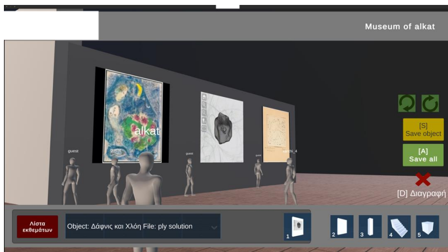
Figure 3. Screenshot during a virtual exhibition creation by a museum curator

A pivotal component of this endeavor is the creation of a virtual museum framework designed to interactively showcase and provide detailed descriptions of exhibits from one or more collections. This innovative tool is based on technologies that have a proven track record of implementing a diverse range of virtual exhibition and museum systems. Specifically, the application amalgamates and adapts the technology of Project Synthesis (Athena Research Center, 2023g), system Dynamus (Kiourt et al., 2016), and project GameIt (Athena Research Center, 2023f). Within this system, every cultural organization gains the autonomy to independently craft its virtual exhibitions.