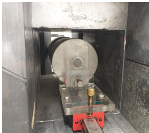
Figure 2. The GEM80 detector and sample configuration

software, taking into account the respective natural background.