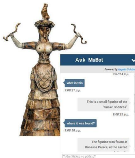
Fig. 2. The Snake Goddess figurine in Cretan MuBot experimental application environment.

The two famous figurines of the Minoan earth goddess with the snakes, possibly representing a mother goddess and a daughter, are exquisite examples of Minoan miniature sculpture. The smallest of the two shows the goddess standing, holding snakes in both of her raised hands. She wears the elaborate Minoan garment – a tight vest with sleeves, which bares her ample bosom, and a long skirt with seven horizontal tiers and a short apron – and an equally elaborate head-dress on which a panther sits. The rather flat, lifeless body is enlivened only by the opulent garments and head-dress. By contrast, the triangular face is dominated by the huge expressive eyes, which convey all the tension of the figure. This figurine was found together with another similar but larger figurine, and other precious objects.