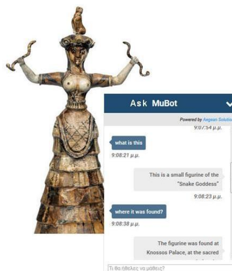
Fig. 2. The Snake Goddess figurine in Cretan MuBot experimental application environment.

The two famous figurines of the Minoan earth goddess with the snakes, possibly representing a mother goddess and a daughter, are exquisite examples of Minoan miniature sculpture. The smallest of the two shows the goddess standing, holding snakes in both of her raised hands. She wears the elaborate Minoan garment – a tight vest with sleeves, which bares her ample bosom, and a long skirt with seven horizontal tiers and a short apron – and an equally elaborate head-dress on which a panther sits. The rather flat, lifeless body is enlivened only by the opulent garments and head-dress. By contrast, the triangular face is dominated by the huge expressive eyes, which convey all the tension of the figure. This figurine was found together with another similar but larger figurine, and other precious objects.