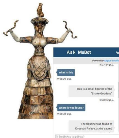
Fig. 2. The Snake Goddess figurine in Cretan MuBot experimental application environment.

The two famous figurines of the Minoan earth goddess with the snakes, possibly representing a mother goddess and a daughter, are exquisite examples of Minoan miniature sculpture. The smallest of the two shows the goddess standing, holding snakes in both of her raised hands. She wears the elaborate Minoan garment – a tight vest with sleeves, which bares her ample bosom, and a long skirt with seven horizontal tiers and a short apron – and an equally elaborate head-dress on which a panther sits. The rather flat, lifeless body is enlivened only by the opulent garments and head-dress. By contrast, the triangular face is dominated by the huge expressive eyes, which convey all the tension of the figure. This figurine was found together with another similar but larger figurine, and other precious objects.