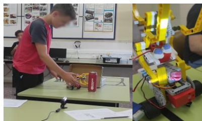
Image 1. Students engage in stop-motion activity during the “Generating Ideas” step

This project draws on a fundamental principle in animation that enhances the impact and realism of a character’s actions by creating a sense of anticipation. This principle builds up tension or expectation before a significant action, engaging the audience and increasing emotion in the scene.