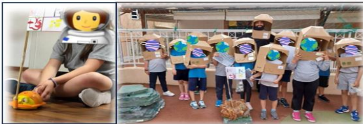
Image 2: Travel to Mars project

Through the ER and Theatre classes, students will prepare to (a) simulate the trip going to Mars, (b) get evidence from the lost contact rover, and (c) then, when returning to Earth, analyze the evidence found and describe the trip experience.