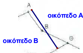
Figure 1. Where are we to place the line so that the two exchanged areas are equal?