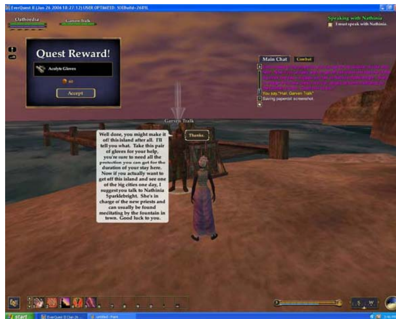
Figure 3. Screenshot of the EverQuest II game

In relation to using a games-based approach to teaching languages Rankin et al., (2006) in a preliminary study used EverQuest II to support the teaching of English language as a second language. A screenshot from EverQuest II is shown in Figure 3. EverQuest II is an example of a Massive Multiplayer Online Role Playing Game (MMORPG) that was found to be useful in generally reinforcing language acquisition. MMORPGs generally create a persistent universe in which hundreds of thousands of players can simultaneously interact in graphically rendered immersive worlds. By completing the quests, Rankin et al., (2006) found that the small number of players used for the purposes of their study who comprised Korean, Chinese and Castilian speakers were able to gain an appreciation for colloquial meanings, verbs and adverbs.