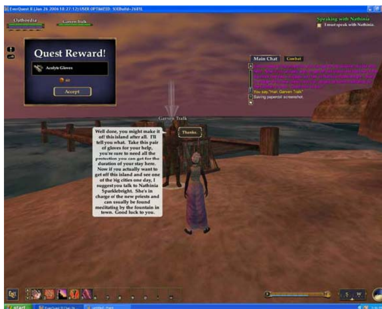
Figure 3. Screenshot of the EverQuest II game

In relation to using a games-based approach to teaching languages Rankin et al., (2006) in a preliminary study used EverQuest II to support the teaching of English language as a second language. A screenshot from EverQuest II is shown in Figure 3. EverQuest II is an example of a Massive Multiplayer Online Role Playing Game (MMORPG) that was found to be useful in generally reinforcing language acquisition. MMORPGs generally create a persistent universe in which hundreds of thousands of players can simultaneously interact in graphically rendered immersive worlds. By completing the quests, Rankin et al., (2006) found that the small number of players used for the purposes of their study who comprised Korean, Chinese and Castilian speakers were able to gain an appreciation for colloquial meanings, verbs and adverbs.