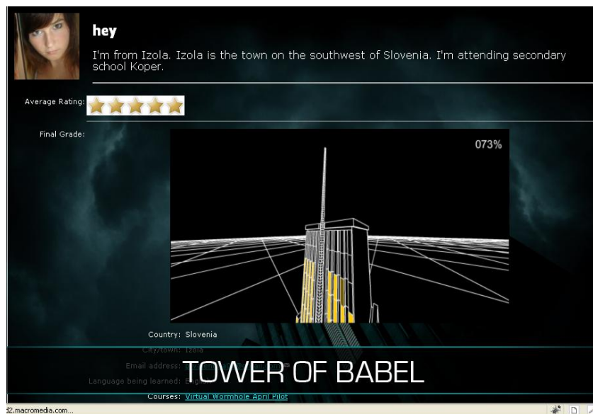
Figure 4. Example of the 'Tower of Babel' interface

solving skills (48.8%), reflection skills (37.7%), analysing and classifying skills (44%), collaborative and teamwork skills (55%), leading and motivating skills (41%), critical thinking skills (32%), and creativity skills (54%). 92% of the students who completed the evaluation questionnaire indicated that they felt there should be more use of ICT in language learning. Of nineteen language teachers who completed a post-test evaluation questionnaire 42% considered that using the ARG to be a very valuable professional experience. Some of the issues raised by the teachers included some technical problems in using the ARG, as well as some teachers (5%) considering that it might be too difficult to monitor students' actions throughout the game. In addition, for teachers participating in the ARG, it did put immense pressure on markers to ensure that students received scores and feedback in a timely manner once they had conducted a quest so that they could continue onto the next quest.