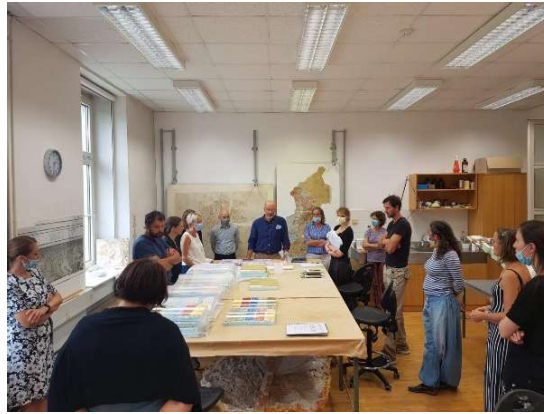
Figure 3: International workshop organised by DRS and ZVKDS:

“Retouching murals, Methodological approaches, techniques and materials”