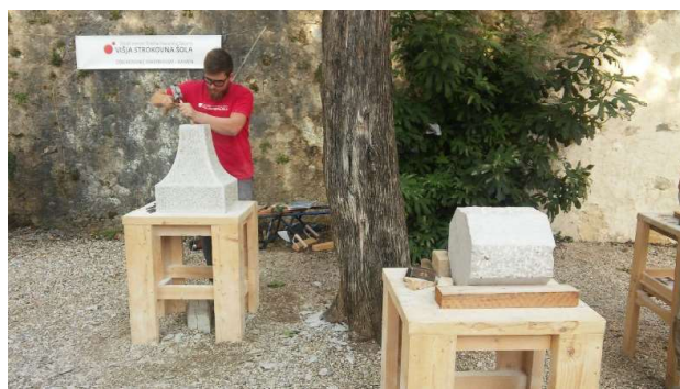
Figure 4: “HAND CARVING NATURAL STONE” stonemasonry workshop organised by the School of Renovation 4 and the Institute for the Protection of Cultural Heritage https://www.sola-prenove.si/

Despite its small size, Slovenia's cultural space is extremely diverse and dynamic. Cultural heritage professions are becoming more dynamic every day, requiring more knowledge and transferable skills, the so-called soft skills. Above all, it is important to note that certain skills cannot be acquired through schooling alone, but that there is a need for the establishment of continuously funded lifelong learning where formal or non-formal acquisition of skills would be recognised.