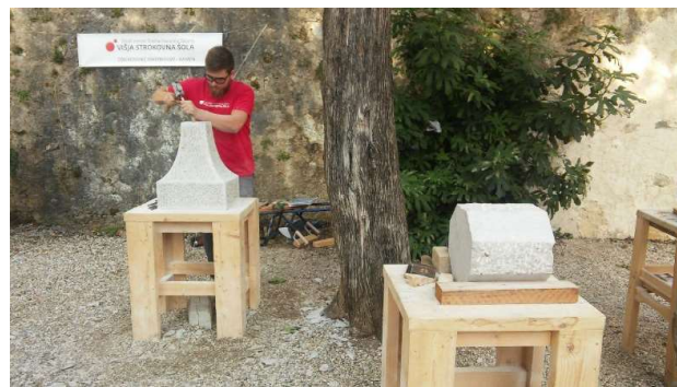
Figure 4: “HAND CARVING NATURAL STONE” stonemasonry workshop organised by the School of Renovation 4 and the Institute for the Protection of Cultural Heritage https://www.sola-prenove.si/

Despite its small size, Slovenia’s cultural space is extremely diverse and dynamic. Cultural heritage professions are becoming more dynamic every day, requiring more knowledge and transferable skills, the so-called soft skills. Above all, it is important to note that certain skills cannot be acquired through schooling alone, but that there is a need for the establishment of continuously funded lifelong learning where formal or non-formal acquisition of skills would be recognised.