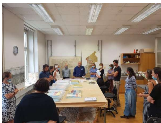
Figure 3: International workshop organised by DRS and ZVKDS:

“Retouching murals, Methodological approaches, techniques and materials”