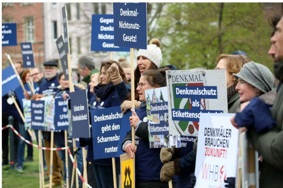
Image 3: The VDR – well connected and argumentative