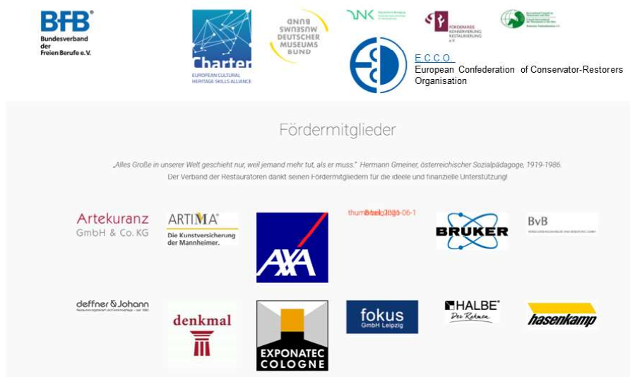
Image 4 The VDR – a reliable partner in society and among professionals

Well – let’s go ahead starting some important questions about the situation in Germany concerning the regulation of the profession: