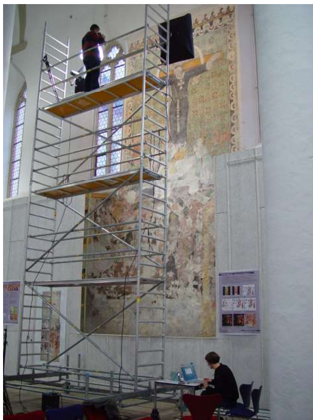
Image 5 (left): restorers in crafts / carpenders