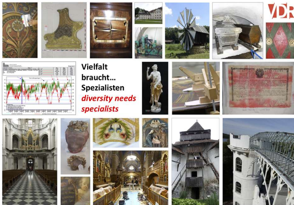
Image 2: The VDR – a specialists-pool, profession needs experts

Specialists are grouped into 19 material specifications. The main concerns of the VDR are the protection and proper preservation of art and cultural assets while respecting their material, art-historical and aesthetic importance.