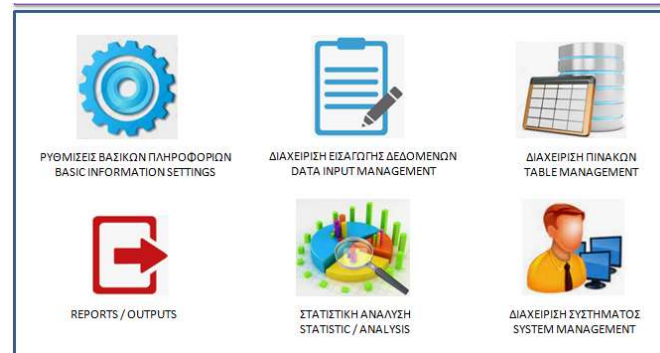
Figure 1: The OLAP- TSA-Model structure

The main functions of the OLAP- TSA-Model include: the data collection unit, the data management unit, the TSA collection unit, the statistical analysis unit and the extended section of individual applications.