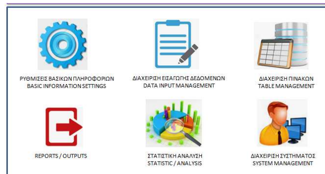
Figure 1: The OLAP- TSA-Model structure

The main functions of the OLAP- TSA-Model include: the data collection unit, the data management unit, the TSA collection unit, the statistical analysis unit and the extended section of individual applications.